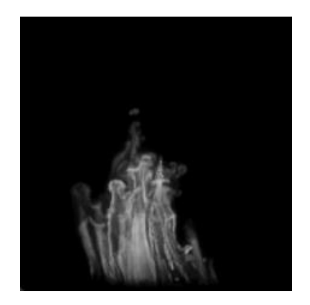
The same texture input as an alpha