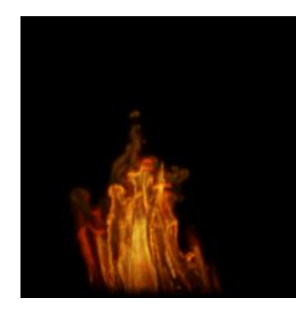
RGB texture input

This texture contains emission and alpha inputs on RGB channels. The emission uses RGB channels, the alpha is an average of RGB channels.