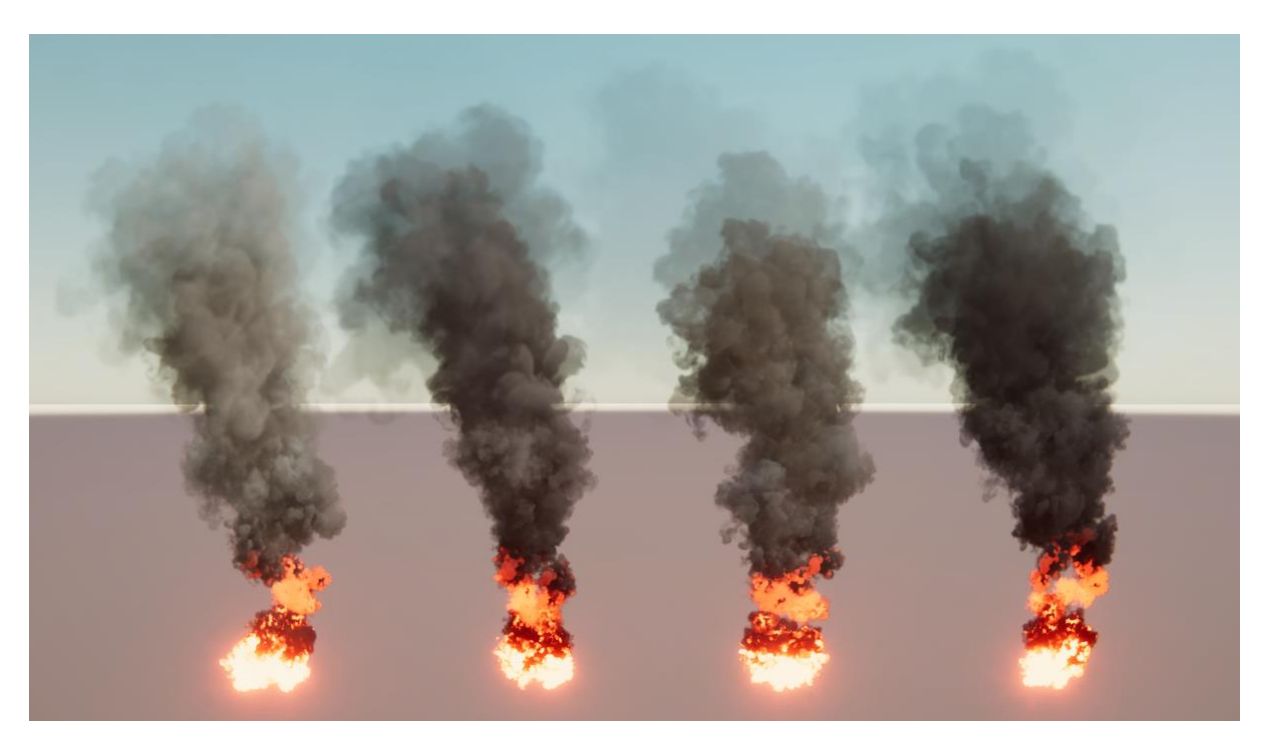
Shaders from left: Lightmap Based Lit, Lightmap Based Unlit, Normal Based Lit, Normal Based Unlit.

These shaders are calculating light data from object's normals and tangent normal maps according to the Unity's Directional Light (Color and Direction) or specified Direction.