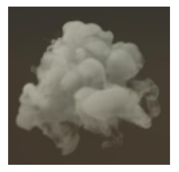
Lightmap Based Material

As normal maps are more common textures, Normal Based Materials can be easier to use, but they are more costly and produce less reliable results with occasional artifacts. On the other hand, because they do not strictly depend on baked lightmaps, they can generate "softer" smoke with full shading intact, as below: