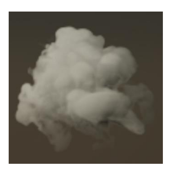
Normal Based Material