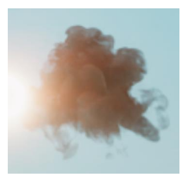
Normal Based Material