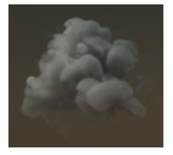
Lightmap Based Material

The result of both shaders are similar, as can be seen below: