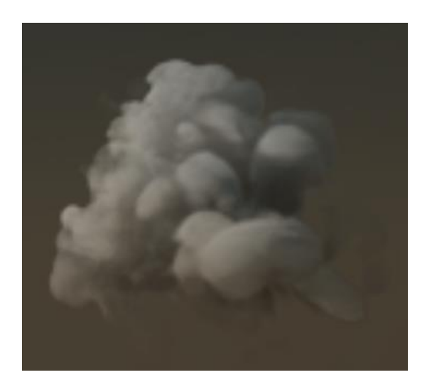
Normal Based Material

As normal maps are more common textures, Normal Based Materials can be easier to use, but they are more costly and produce less reliable results with occasional artifacts. On the other hand, because they do not strictly depend on baked lightmaps, they can generate "softer" smoke with full shading intact, as below: